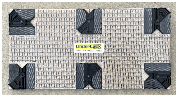
Gen4 plank format with running bond brick pattern