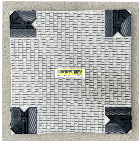
Gen4 square format